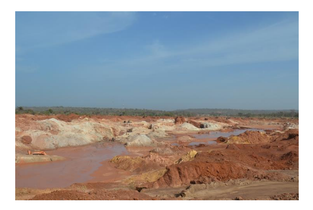
Figure One: Extensive surface artisanal workings at Zone B; note the abandoned excavator (left hand of picture) from previous artisanal mining

Previously acquired ground Induced polarisation /resistivity data suggests that the linear structure, which follows Zone B over much of its length, becomes structurally complex in the area of these new RC fences